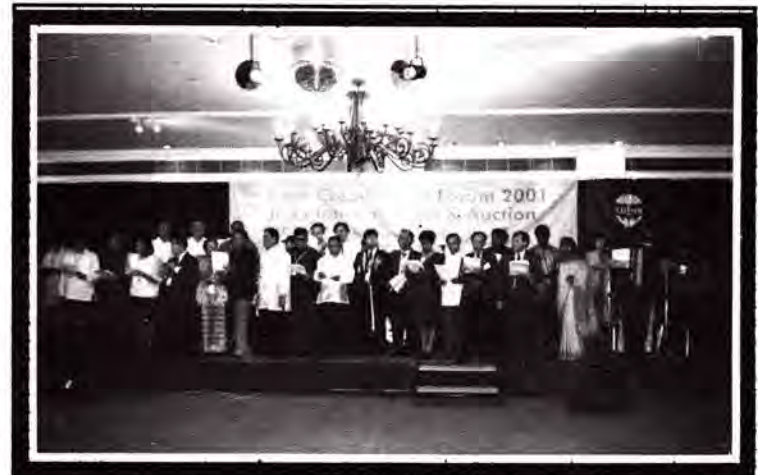
ACCU Hong Kong, September 20 - 22, 2001 Participant singing with other delegates