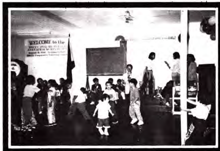
Small boys doing some dance steps hoping to get some balloons (background) upon winning.