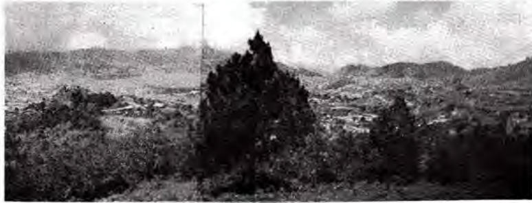
Photo on the left shows the view from the BBCCC property overlooking La Trinidad.

When all the roads will have been laid with “camada” stones, the installation of the electrical and water systems will follow before the paving of all roads. This project will be a first class housing subdivision with minimal expense because the site development is being undertaken by the housing subdivision with minimal expense because the site development is being undertaken by the Housing Management Team under the Housing Committee, with the close supervision of the Board, not by a straight contractor.