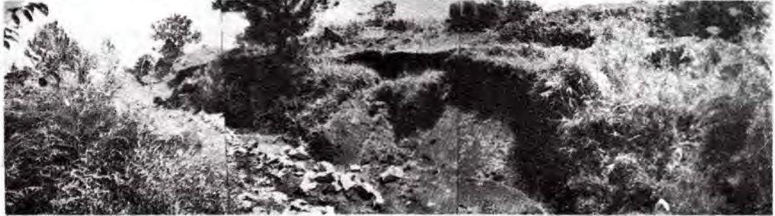
Photo on the right shows the view from the corners 3-4, with the road to Beckel, contracted by the government. (MIS)