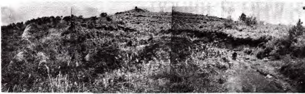
Photo on the left shows the scanned and spliced photos of the proposed subdivision. (MIS)